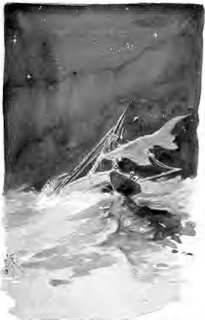
"THE HALF-WRECKED MARINER, HIS COMPASS LOST."—Page 50.